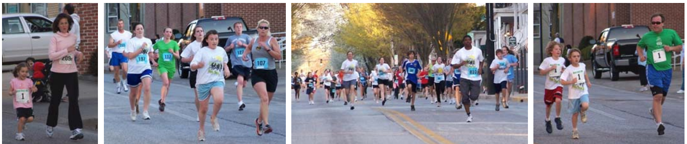
Highlights from previous Main Street Mile events