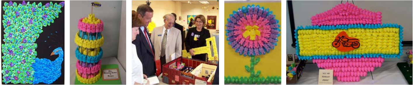
It is amazing what one can do with a few Peeps, even Governor O'Malley had to check it out last year