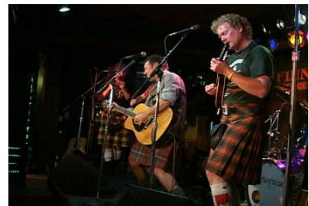
Barleyjuice, the shamRock band from Philadelphia, will play two concerts at the Carroll Arts Center on March 13 th