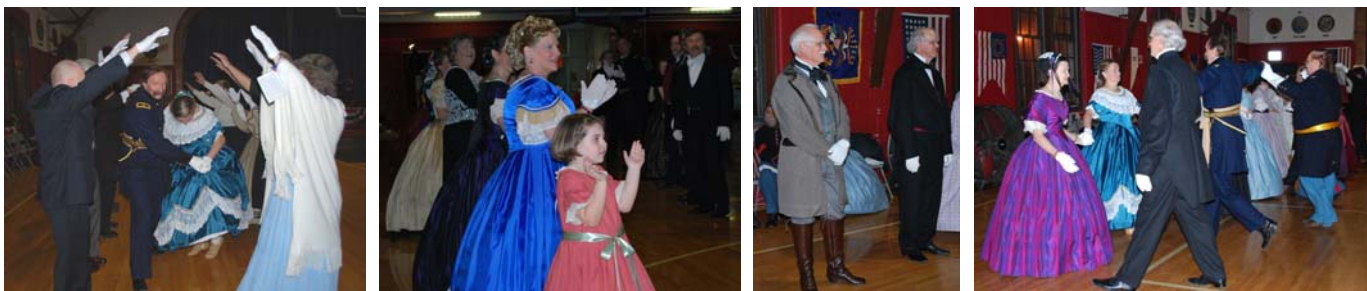
Scenes from the 2 nd annual Corbit's Charge Civil War Ball in March 2009