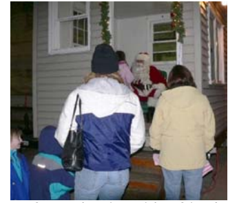
Santa chatting with a friend in his house on Locust Lane