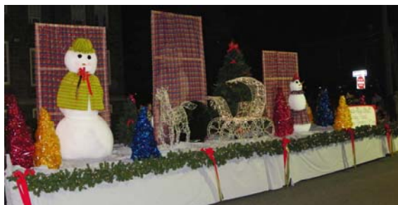
Interstate Battery's lighted float was previewed in the FallFest Parade in September