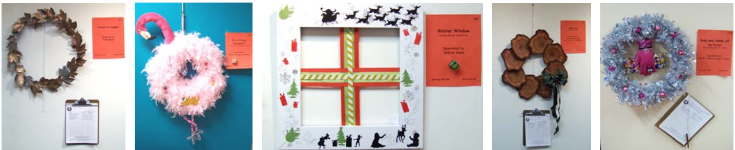
Some Examples of the Wreaths Displayed at Last Year's Festival of Wreaths

For the 12 th straight year, the Carroll County Arts Council will host its annual "Festival of Wreaths" from December 2 nd through December 6 th at the Carroll Arts Center, 91 West Main Street. The Festival, which has become one of Carroll County's best attended holiday events, will again feature more than 200 uniquely decorated theme wreaths on display for the public through a five-day silent auction. All proceeds from this annual event benefit the Carroll County Arts Council. The wreaths will range from elegant to whimsical to traditional to funky. The public is invited to vote for their favorites throughout the event and awards in several categories will be presented. The wreaths themselves are crafted from materials as diverse as dried flowers, copper tubing, stained glass, wood, wrought iron, and pheasant feathers. Festival Hours are 10:00 a.m. to 8:00 p.m. Wednesday through Saturday and 1:00 p.m. to 4:00 p.m. on Sunday. Bidding ends promptly at 4:00 p.m. on Sunday, December 6 th . The highest bidders are not required to be present at the close of the auction. Admission to the Festival is free. For more information on The Festival of Wreaths, call the Carroll County Arts Council at (410) 848-7272.