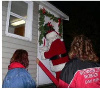
Santa Claus enters his house after a Holiday Tree Lighting event