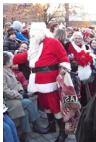
Santa & Mrs. Claus in the Locust Lane crowd with one of his fans looking on last year