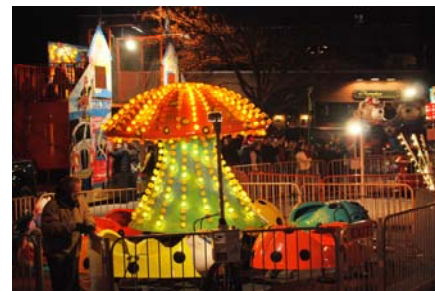
Some of last year's children's rides at "Miracle on Main Street"