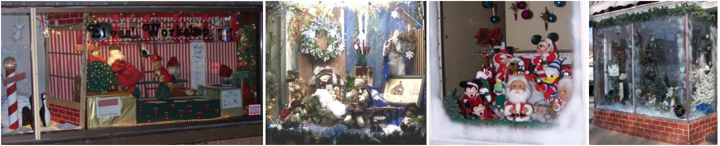
Here is a sampling of holiday window displays in Downtown Westminster over the years

Get into the holiday spirit by taking a stroll downtown some evening after Thanksgiving with your loved ones and checking out the numerous holiday storefront and window displays. Downtown Westminster is truly a festive looking place heading into the holidays with all of the decorated trees, shrubs and holiday lights done by the City and the many wonderful window displays completed by the downtown businesses. While many of the windows are done up to compete in the Mayor's Cup Holiday Decorating Contest that is annually awarded at the tree lighting ceremony, there are just as many that do it solely for the spirit of the season. Come to Downtown Westminster and enjoy!