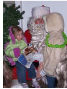
Santa chatting with some admirers on his steps